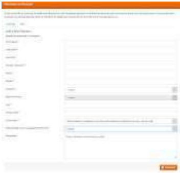
Nomination Window.PNG.jpg 98K